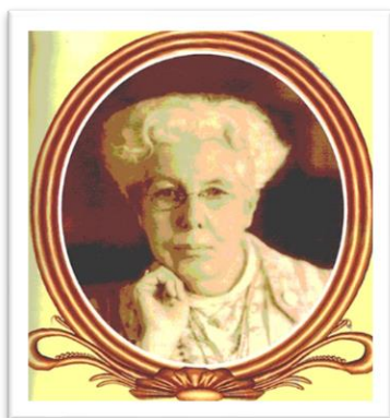
Dr. Annie Besant